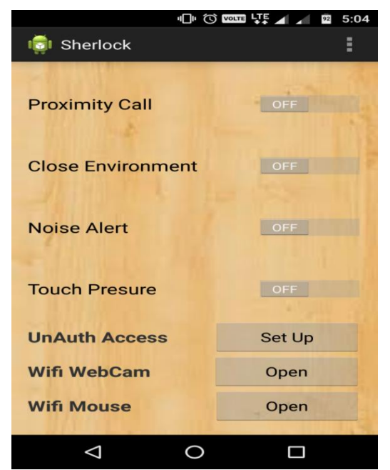
Main layout where we can enable or disable the services