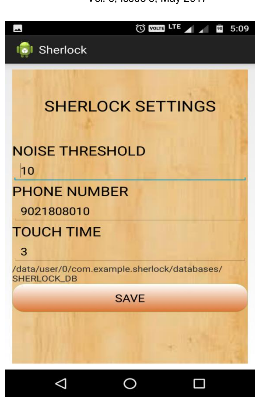
Start layout to get noise threshold, phone no, and touch time

ISO 3297:2007 Certified Vol. 6, Issue 5, May 2017